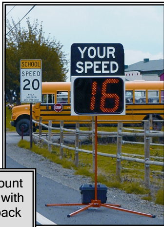
Stand mount powered with battery pack

SpeedCheck™ portable displays are very practical for day-to-day use. Typically used for short-term needs, such as responding to school zone speeding problems, neighborhood complaints, pedestrian safety needs, construction zones, special events and weather concerns.